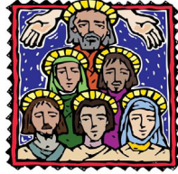
ALL SAINTS' DAY