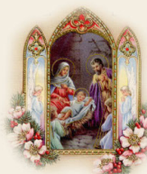
A Christmas Spiritual Bouquet

All Masses on Christmas Day, including the Christmas Vigil Mass at 5:00 pm, will be offered for all individuals, living or deceased, named on the Spiritual Bouquet Mass Cards. These Christmas cards are available in the vestibule of the Church and at the Rectory office during office hours. Complete the front of the envelope and return it with your donation of $5 per name. Place it in the collection basket or return it to the Rectory office. The greeting card and envelope are yours to present or keep. All intentions will be placed on the Altar during all Christmas Masses.