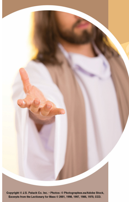
Copyright © J.S. Patach Co. Inc. • Photos: © Photographee.eu/Adobe Stock, Excerpts from the Lectionary for Mass © 2001, 1998, 1997, 1986, 1970, CCD.