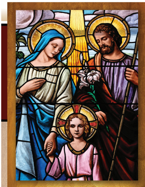
Copyright © J.S. Paluch Co. Inc. • Photos: © zallitic / AdobeStock - Excerpts from the Lectionary for Mass © 2001, 1998, 1997, 1986, 1970, CCD.